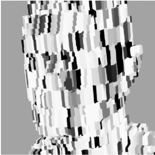
Final cell_noise settings