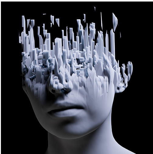
Further example with cell_noise scaled in Y

That's it. Remember to increase the volume_samples for any lights in the scene when rendering the final animation.