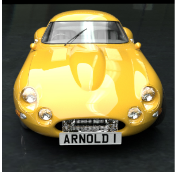
With MaterialX lookdev