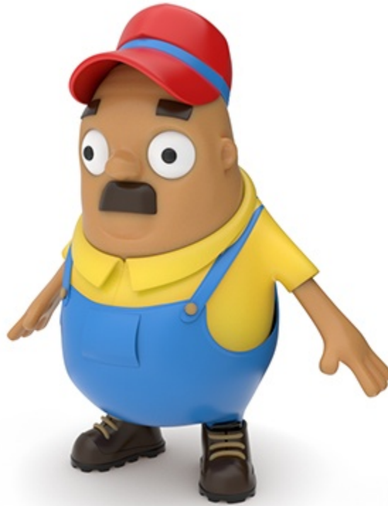
Subdivision vs no subdivision (rollover image)

A native C4D Subdivision Surface object is translated to Arnold subdivision by default instead of exporting the tessellated geometry. This is because subdivision in render time is much more efficient, allowing the renderer to make extra optimizations.