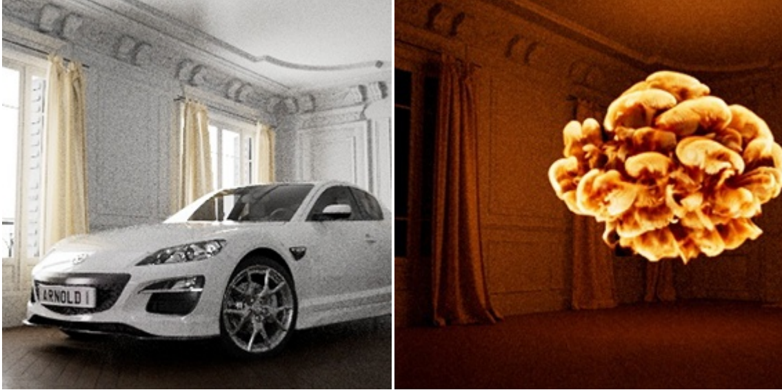
Rollover to view denoised images

There are three denoising options available for rendering with Arnold: