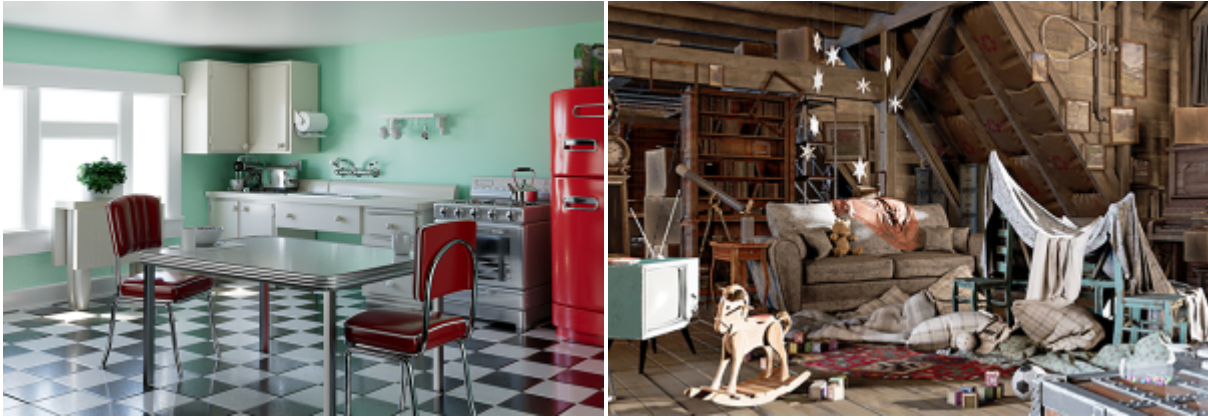
USD kitchen set asset available here . NVIDIA USD attic asset available here .

A procedural node that is capable of reading USD files.