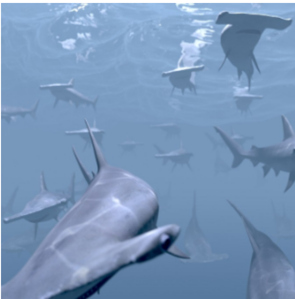
Fog used for under water effect

It is not possible to render both fog and atmosphere_volume in the same scene.