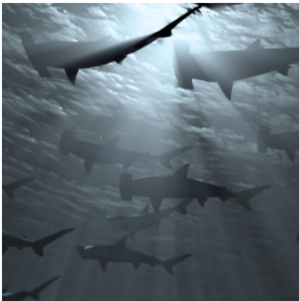
atmosphere_volume used to simulate rays of sunlight