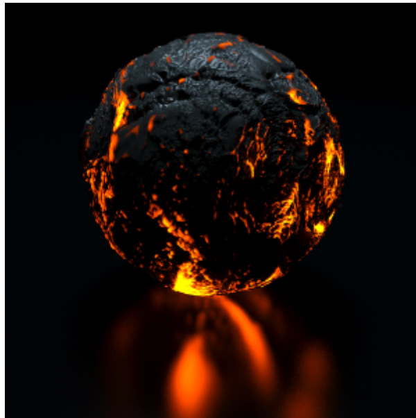
Texture map representing hot lava connected to emission_color