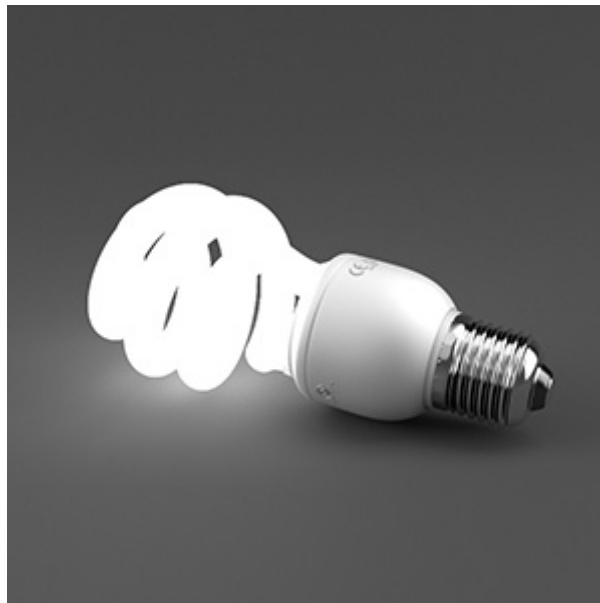
Bulb with emissive shader assigned to it (rollover image)

i Note that a mesh_light may work better in a situation where you need an object to emit light that casts realistic ray-traced shadows.