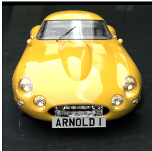
With MaterialX lookdev